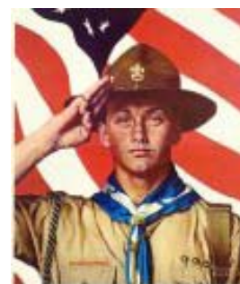
Scouting is a value based character building program to last a lifetime.