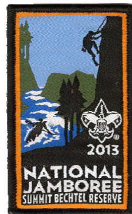
The council contingent departs for the jamboree on July 10th, 2013 returning on the 24th.

Thirty-two Scouts and leaders from Troop 70 will be attending this exciting event.